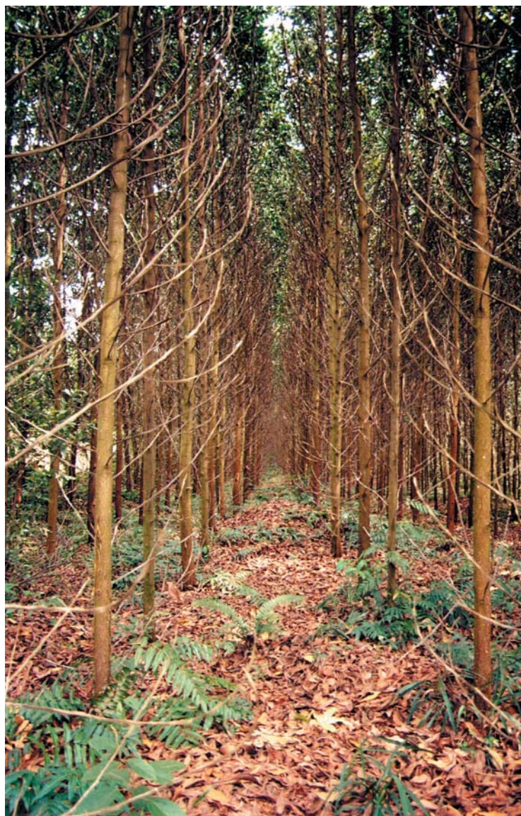
One of Asia Pulp and Paper's acacia plantations.