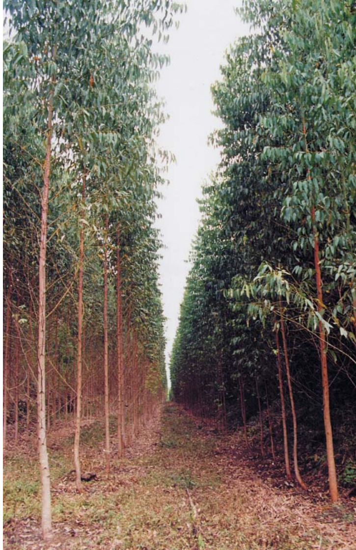
One of Asia Pulp and Paper's eucalyptus trial plantations.