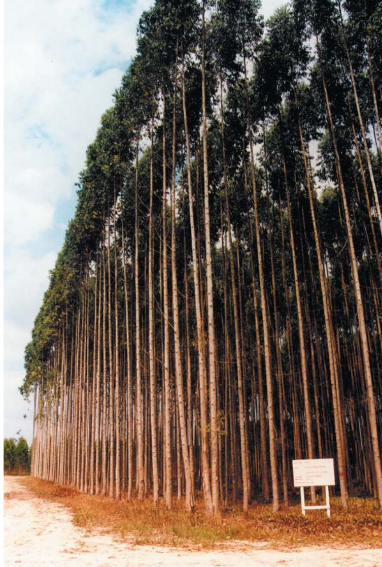
One of Asia Pulp and Paper's eucalyptus trial plantations. APP's monoculture is replacing forest, and in the process destroying local livelihoods.