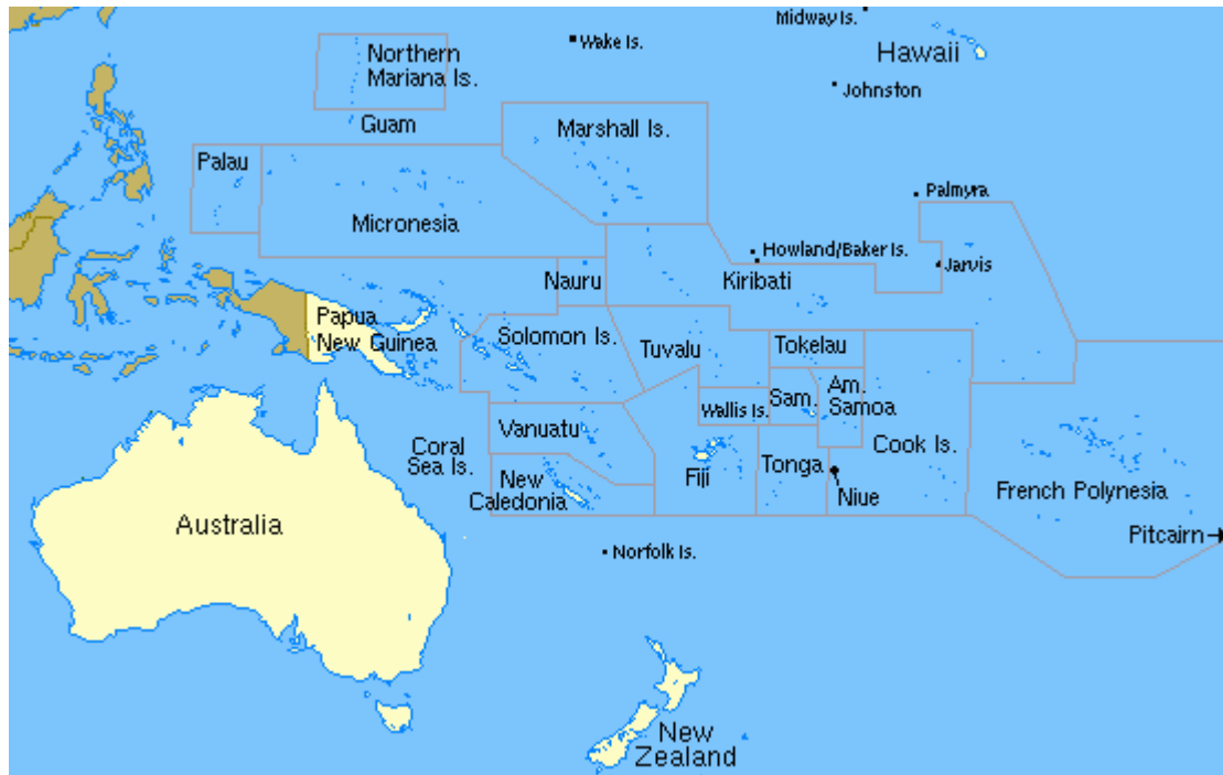
Map 1 Political Jurisdictions